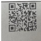
6 th Grade

Bible Treasure Verse: The Lord is my shepherd; I shall not want. He maketh me to lie down in green pastures: he leadeth me beside the still waters. He restoreth my soul: he leadeth me in the paths of righteousness for his name's sake. Yea, though I walk through the valley of the shadow of death, I will fear no evil: for thou art with me; thy rod and thy staff they comfort me. Thou preparest a table before me in the presence of mine enemies: thou anointest my head with oil; my cup runneth over. Surely goodness and mercy shall follow me all the days of my life: and I will dwell in the house of the Lord for ever. Psalm 23